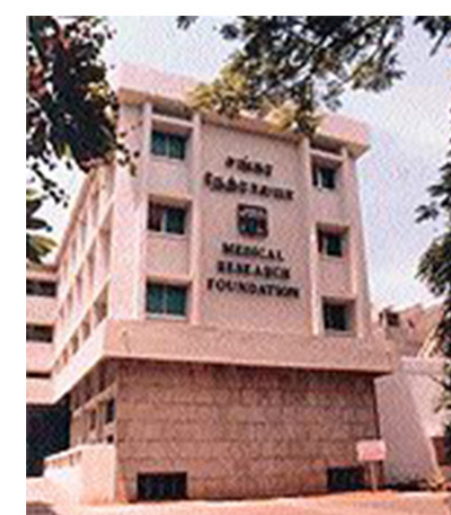
Sankara Nethralaya, Chennai

Telehealth initiatives have enabled access to healthcare for people in remote areas.