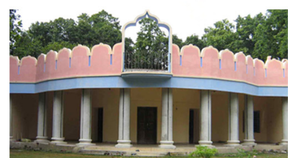
Barrackpore, West Bengal