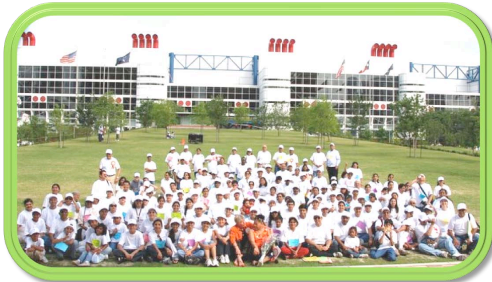
Walk for Values USA - Houston Post-walk Group Photo

The race for mankind to return to its humanitarian roots of human values has begun! ...with a Walk for Values!