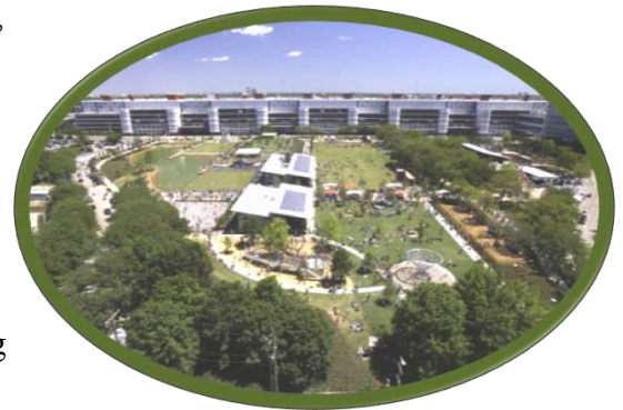
Discovery Green Park Downtown Houston (Aerial View)