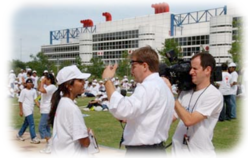
Walk for Values USA - Houston Committee member being interviewed by a FOX 26 News Reporter

What's next for the Houston Walk for Values Committee? Reflect upon the lessons learned and devise ways to improve it. Figuring out what worked and what didn't work is the first step. Planning on how to improve the Walk is the next big task. How can we enhance participation? How can we broaden the outreach to reach to more communities? What improvements can be done to the opening and closing ceremonies? These are just some of the many questions that the committee will be working to find an answer to. Working harmoniously, the next Walk for Values – Houston will surpass the last one in its organization, participation and commitment to practice human values in our