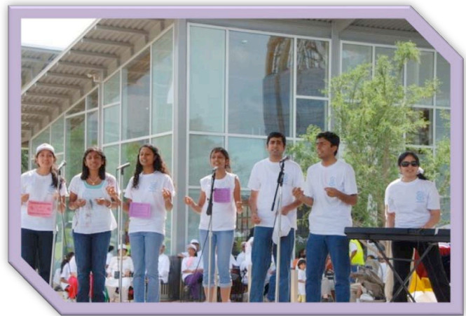
Youth Singers of Sathya Sai Organization