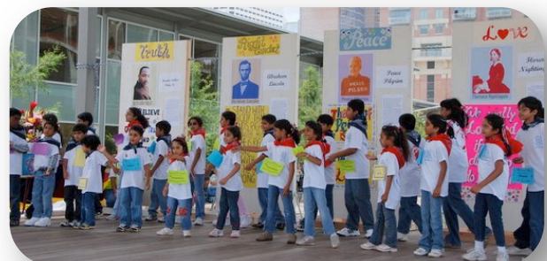
Children Dancing to “Put A Little Love in Your Heart”